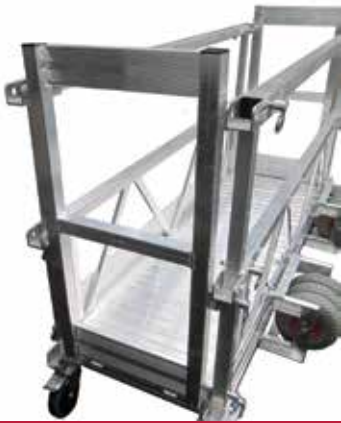
End guardrail can be used in combination with Walk-Thru Stirrups