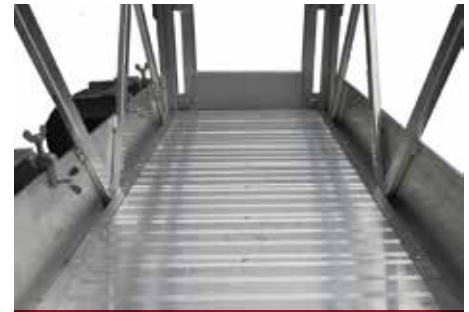
Durable, light weight aluminum deck