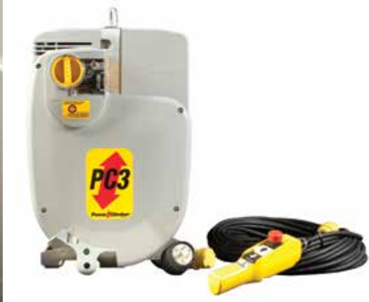
Robust remote control system