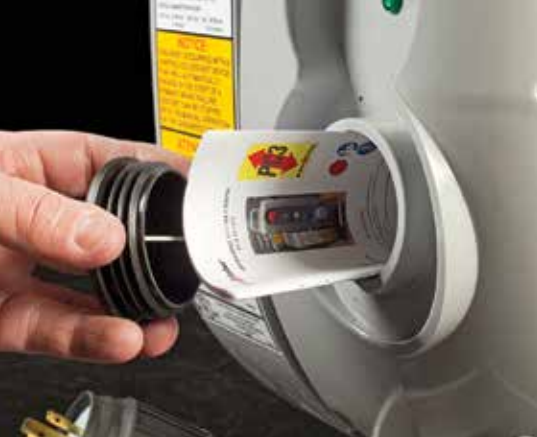
Easy to locate Operators Manual